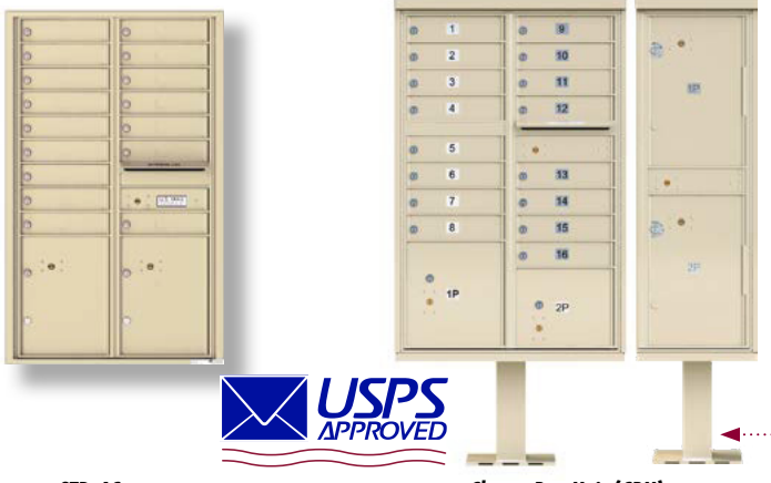
STD-4C Recessed or Surface Mounted