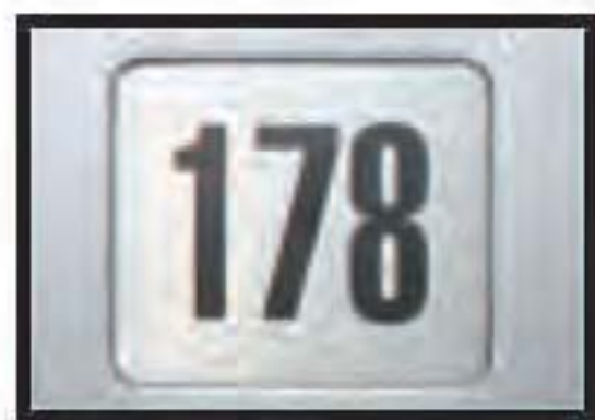
Decal Numbers (1-1/2"Hx1-3/4"W)

Multiple door identification options including decals (with up to six characters) or engraving, with several font and color choices.