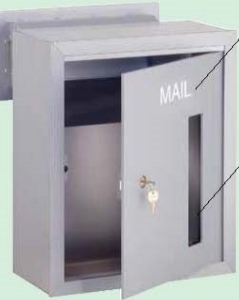
#2256 with optional custom engraving - regular (#2266) and mail drop (#2255) displayed