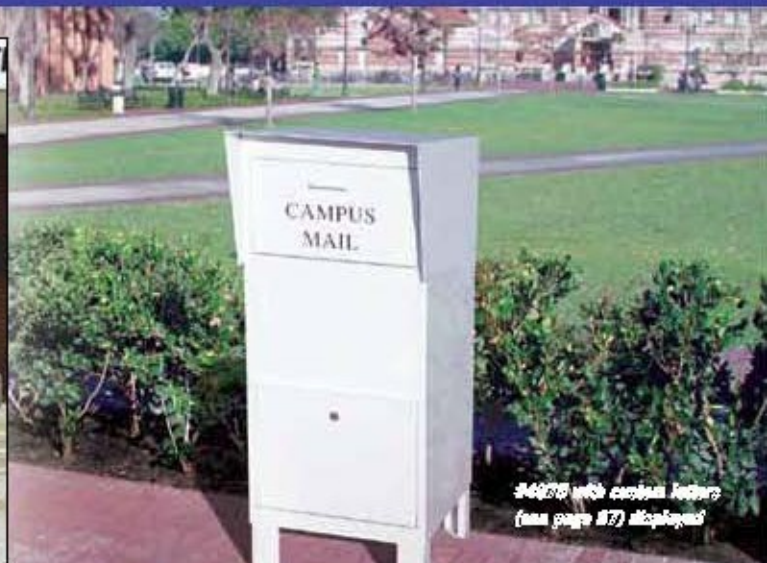
4975 with custom letter (see page #7) displayed