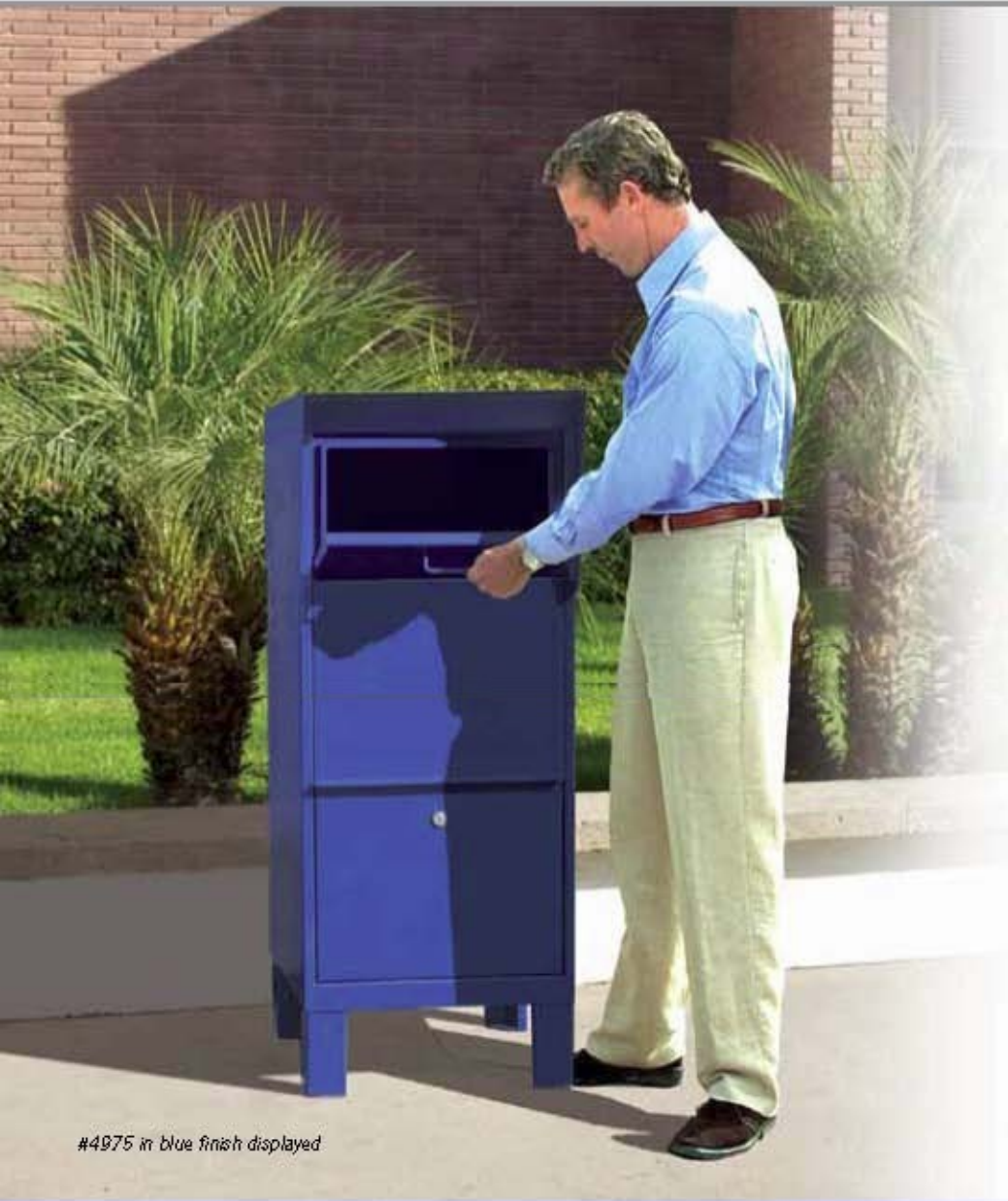
#4975 in blue finish displayed