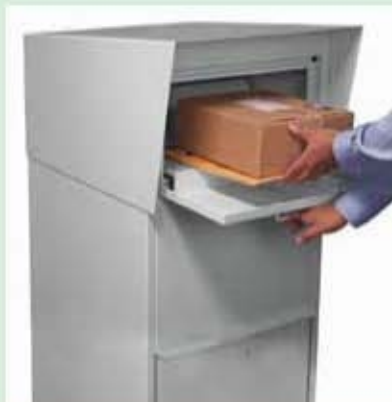
Convenient depositing of items