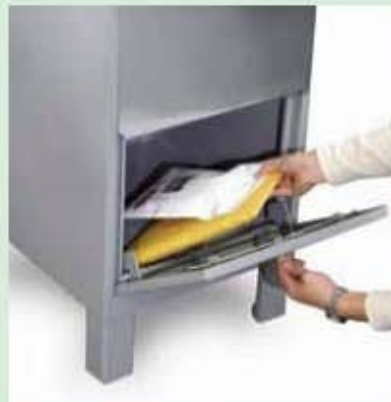
Secure collection of items