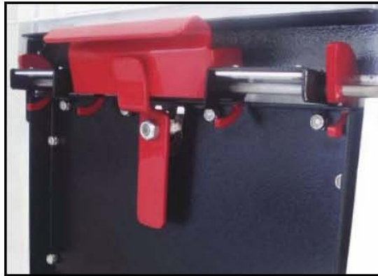
Locked Door - Inside View

LEVEL TWO includes our new 5-point locking mechanism, the CLAW Lock. An 11 gauge stainless steel cam (latch) pushes up on the lift plate, rotating FOUR stainless steel CLAWS into the door bracket receiver. The CLAW Lock quadruples the security of the lock!