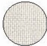
1686 DARK PEARL