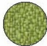
1676 GREEN APPLE