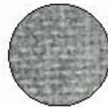
1690 GRAY MIX